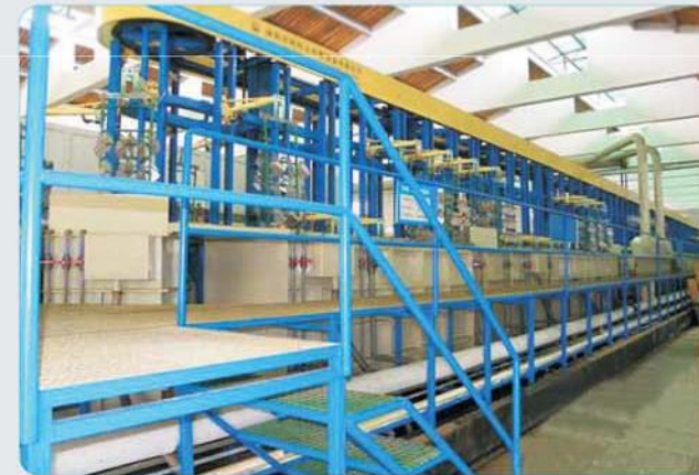
← Plastic plating line