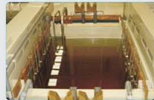
Conductive & suction system