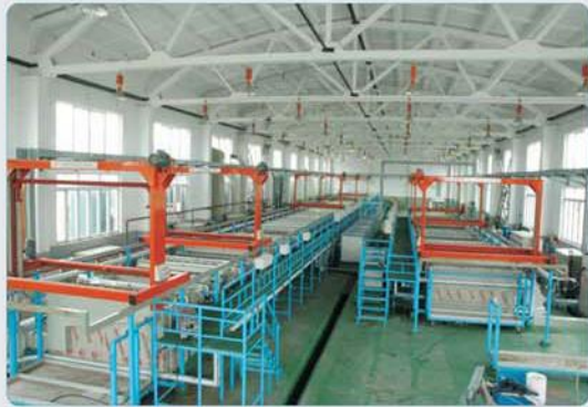
← Electroless nickel plating