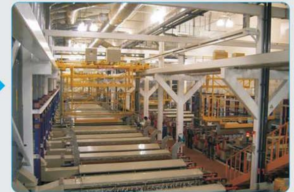
Copper plating line →