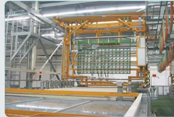
← Plating line for auto parts