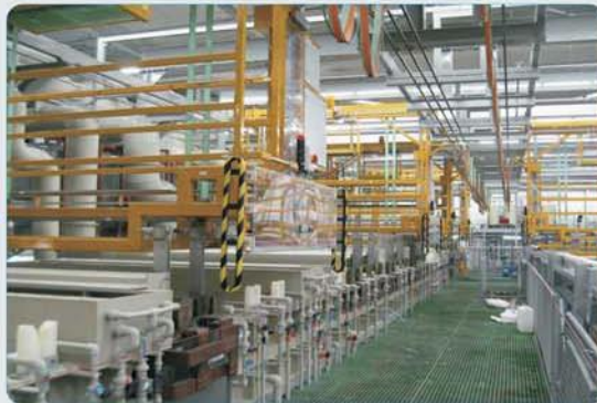
Auto parts plating line →