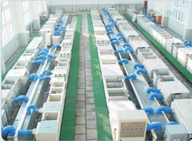
← Manual plating line