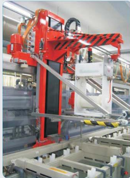
Silver plating line →