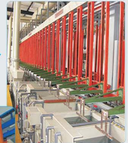
Nickel plating line →