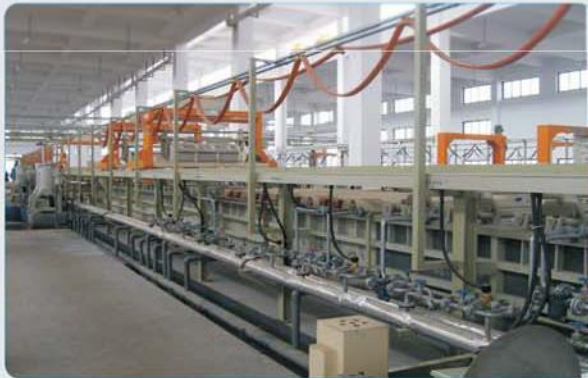
← Zinc plating line