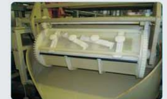
Barrel ( IV )