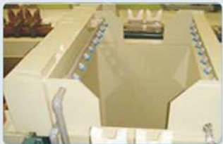
Automatic spraying system