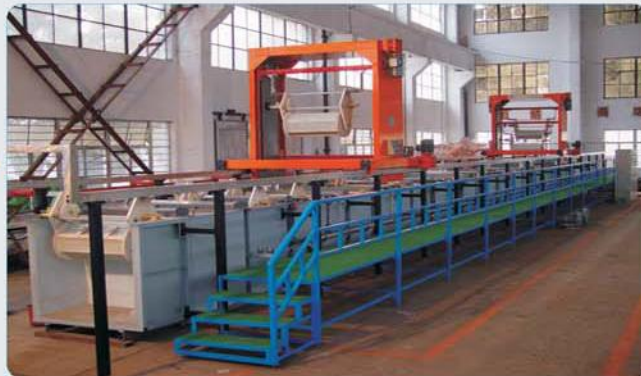
Nickel plating line →