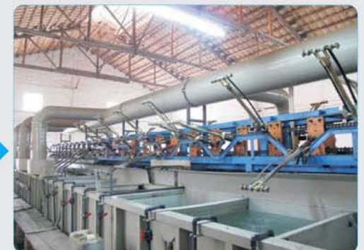
Plumbing plating line →