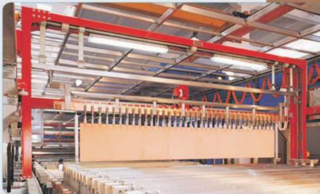
PCB Plating Line