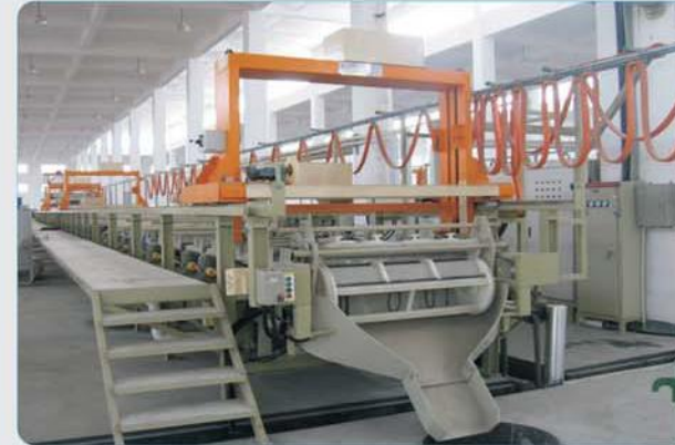
← Fasteners plating line