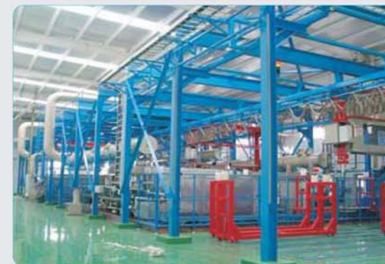
← Plastic plating line