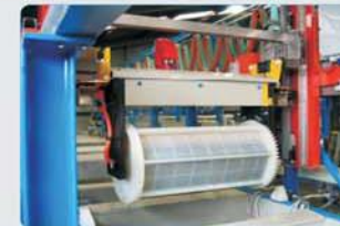
Barrel ( II )