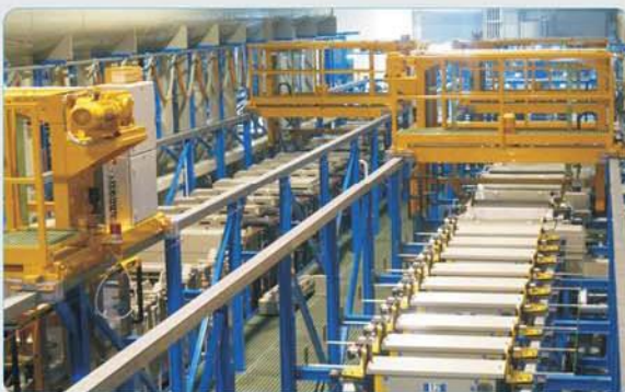
← Zinc nickel alloy plating line