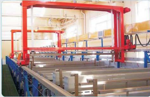
Chrome plating line →