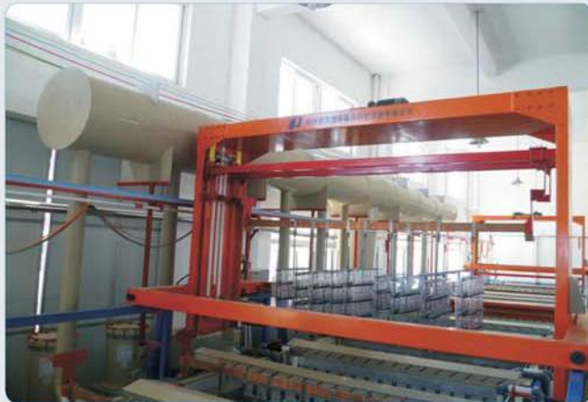
← Zinc alloy plating line