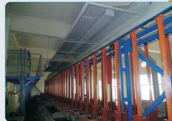
← Zinc plating line