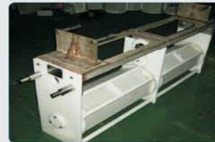
Barrel ( I )