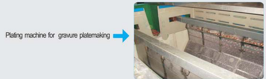
Plating machine for gravure platemaking →