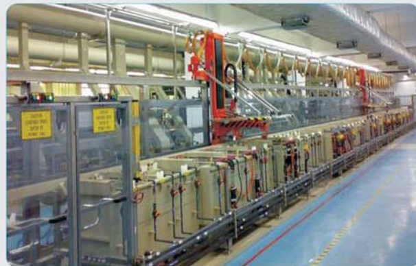
← Nickel plating line