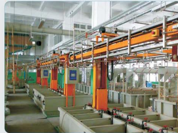
← Cleanout line for plating