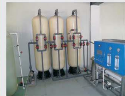
Purification water system