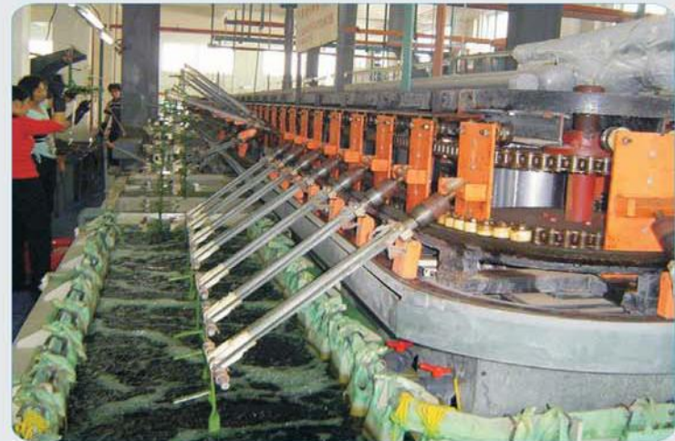
↑ Faucet plating line